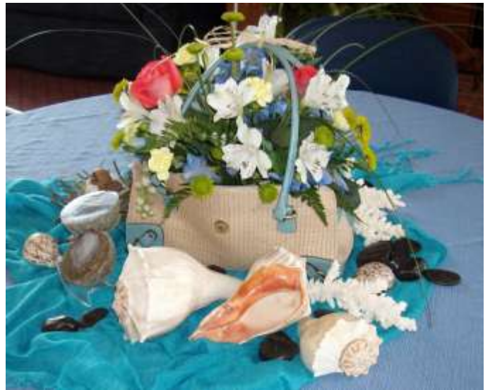
"Nature" flower arrangement from annual tea.

On Saturday the 25th of April the St Martha's Guild hosted their annual Tea. We had a full house. Fitch Hall will hold 120 and although there were a few empty chairs...none of us working in the kitchen were seated...We did no advertising except within our parish, so I would like to thank all of you who brought a friend or friends to witness St. Mary's Radical Hospitality. I would like to include a thank you note we received: