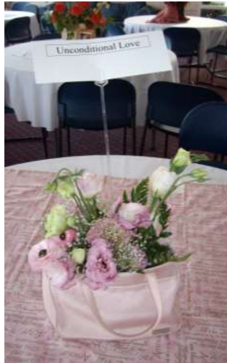
An arrangement from the Spring Tea