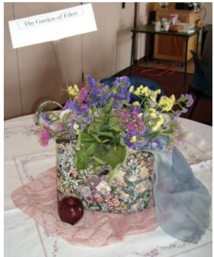
Another arrangement from the Spring Tea