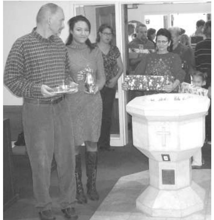
These pages: Bringing in the "Angel Tree" gifts at the December 20th service, and the crèche displays.