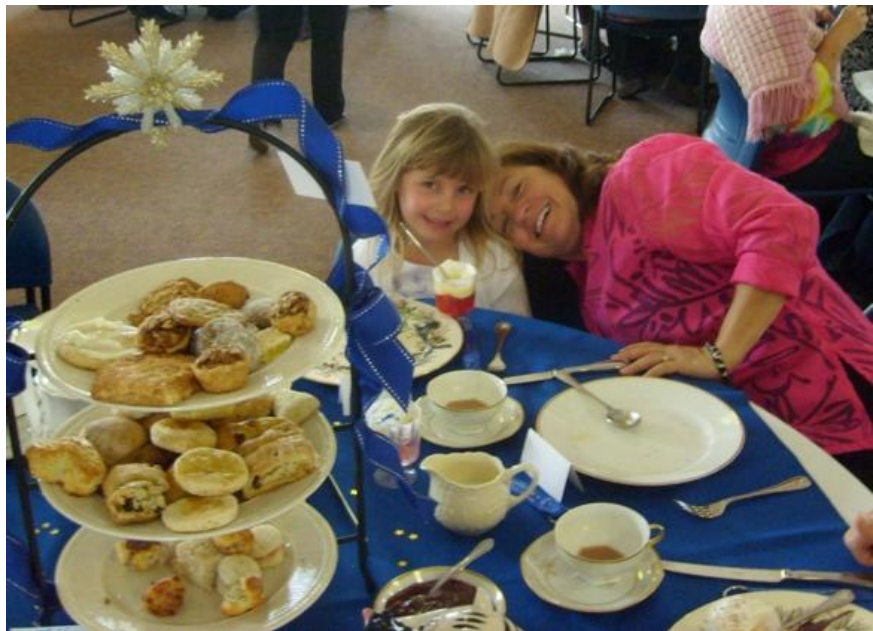
Saying "cheese" at the January 14th tea.